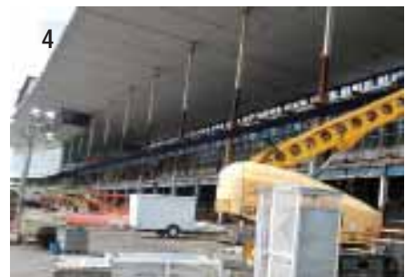
1 Artist's impression 2,3,4 Construction progress (March - April 2011)